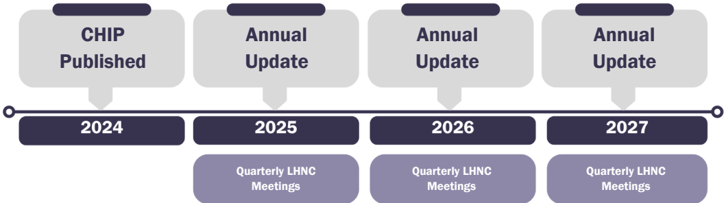
Figure 3. 2024-2027 Napa County CHIP Evaluation Timeline

Implementation of the 2024 CHIP will occur over three years, with progress tracked in quarterly meetings of the Live Healthy Napa County (LHNC) collaborative and through an annual evaluation (Figure 3). The quarterly LHNC partner meetings will serve as informal check-ins for CHIP evaluations and progress updates, while the annual evaluations will be formal reports published by the end of the calendar year. In August 2024, community partners learned of the timeline for the following three years CHIP implementation and evaluation detailed in Figure 3. The 36 funded strategies included in this plan were required to develop logic models with measurable outputs and outcomes as a condition of receiving funding. Funded projects will provide quarterly or biannual updates that will contribute to an annual evaluation of progress toward the goals and objectives within each priority area. Unfunded strategies are also asked to report annual outcome measures. Progress toward outcomes of both the individual strategies within the CHIP and community health metrics related to the five priority areas will be updated annually on an interactive public dashboard.