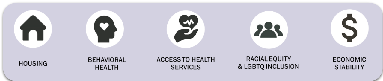
Figure 1. 2023 Community Health Assessment Priority Areas

This plan includes the resources and organizations that will be engaged in implementing specific strategies to improve the health and well-being of Napa County community members, including measurable outcomes that will be used to track progress within each priority area. While our collective goals and objectives are static, the strategies and measures described in the CHIP are dynamic by design. We are committed to engaging in ongoing evaluation, and shifting our strategies based on that data collection. We will continue to regularly engage our community partners, to review our progress and processes, using their feedback to update our improvement plan as needed. This process will naturally include engaging community members and end users of the programs represented in the CHIP to more deeply understand their experiences.